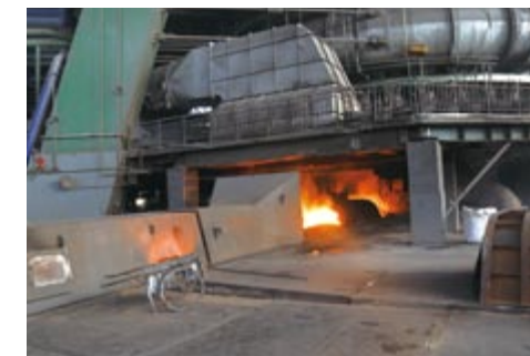
首钢京唐1#高炉出铁口的除尘效果 Dedusting effect at taphole of 1# BF, Shougang Jingtang

BSIET has obtained rich technical deposit in dedusting of BF casthouse. Since 1970s last Century, BSIET has applied himself to studying, developing and tackling key problems of the BF environmental engineering. BSIET firstly and independently designed and realized the dedusting in BF casthouses to greatly improve the working conditions in the BF casthouses. It won the 2 nd Prize of Metallurgical Science and Technology Result.