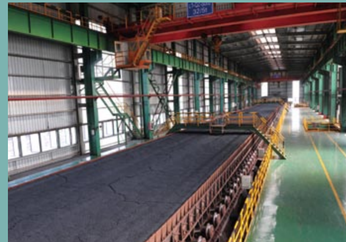
清洁的烧结工厂 Clean sintering plant

Operating status: Since operation, the dedusting system has been always working in good condition. The work-post dust concentration \leq 5\text{mg}/\text{Nm}^3 and the dust exhaust concentration \leq 20\text{mg}/\text{Nm}^3 satisfy the advanced level of the environmental protection in the world.