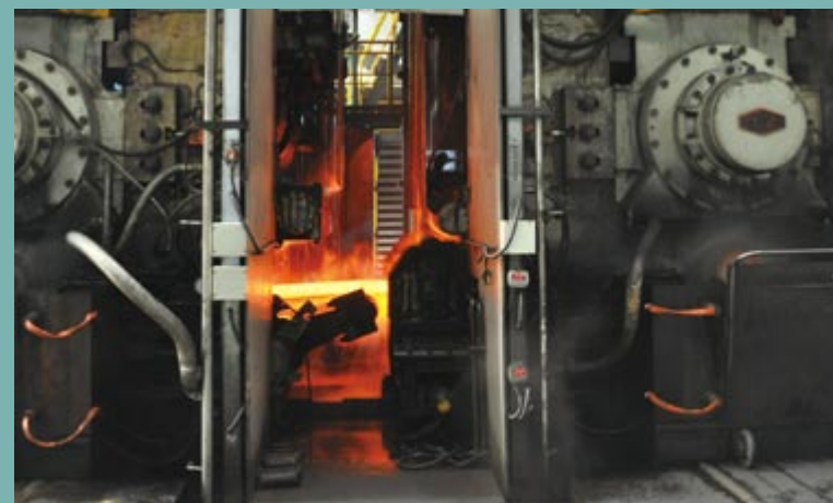
精轧机除尘系统运行时烟尘情况 Fume dust condition in case of operation of finishing mill dedusting system