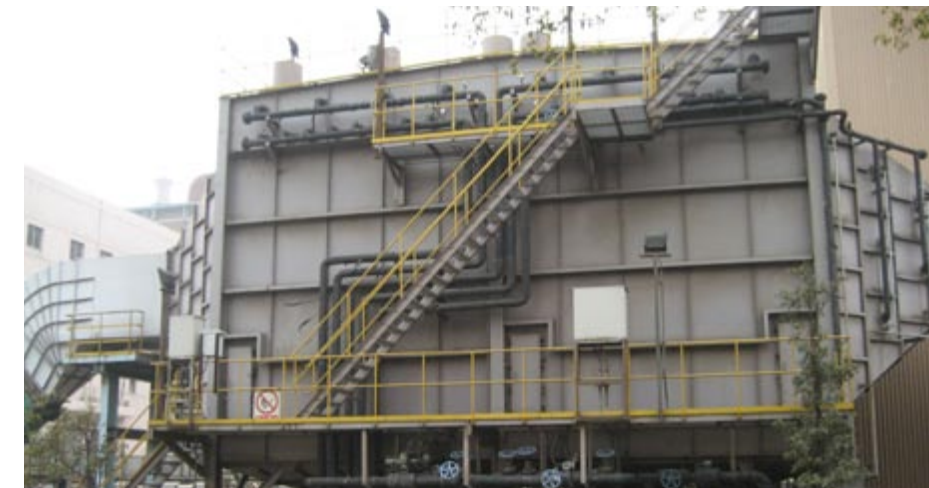
湿式电除尘 Wet ESP