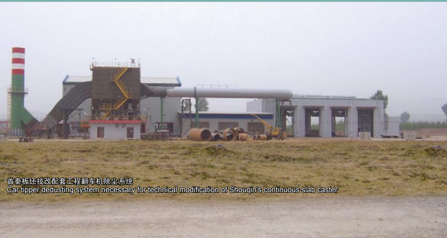
首秦板坯技改配套工程翻车机除尘系统 Car tipper dedusting system necessary for technical modification of Shouqin's continuous slab caster

Operating status: The dust catcher operates stably, the treatment effect is obvious, the dust exhaust and work-post dust concentration satisfy the requirements specified in the related regulations.