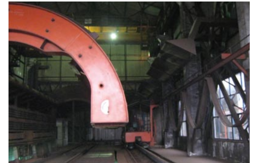
车位除尘罩 Dust hood in car position

Non-standard design of air suction openings (They are arranged in more layers according to different positions and different air volumes), and so on.