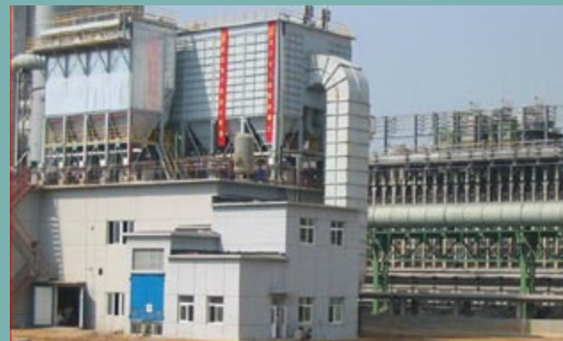
迁钢6m顶装焦炉除尘地面站 Dedusting ground station for 6m top charging coke ovens of Qiangang