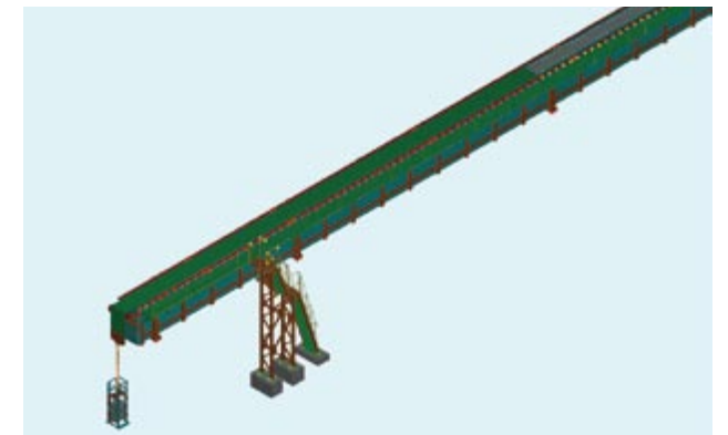
焦炉矩形推焦除尘干管三维设计 3-D design for main dedusting pipe of coke oven rectangular coke guide