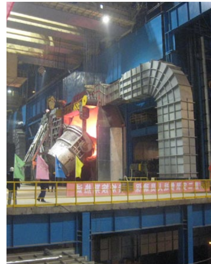
迁钢三炼钢注入铁水时的除尘效果 Dedusting effect during hot metal pouring, Qiangang No.3 Steel Making Plant