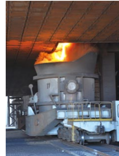
首钢京唐1#高炉摆槽到铁罐处的除尘效果 Dedusting effect from swinging chute to HM ladle of 1# BF, Shougang Jingtang

在高炉出铁场除尘方面，首钢国际工程公司具有深厚的技术积淀，从上世纪70年代开始致力于高炉环境工程的研究与攻关，率先自行设计并实现了高炉出铁场除尘，大大改善了高炉出铁场的劳动条件，荣获冶金部科技成果二等奖。