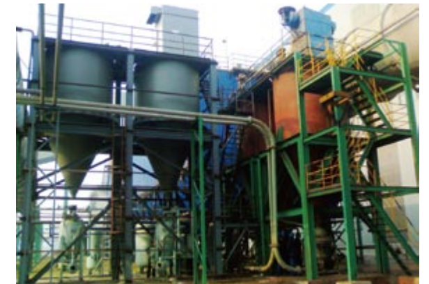
首钢京唐 550\text{m}^2 烧结机工程除尘灰密相输送 Dense-phase conveying of dust in Shougang Jingtang 550\text{m}^2 sintering machine

Proprietary technology: The world advanced low-speed sense-phase conveying technology is adopted for conveying of dust to save the compressed air and reduce the pipe wearing.