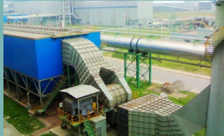
首钢京唐550m 2 烧结机机尾除尘系统 Dedusting system for tail of 550m 2 sintering machine of Shougang Jingtang

获奖情况： 首钢京唐550m 2 烧结机工程设计获冶金行业全国优秀工程设计一等奖