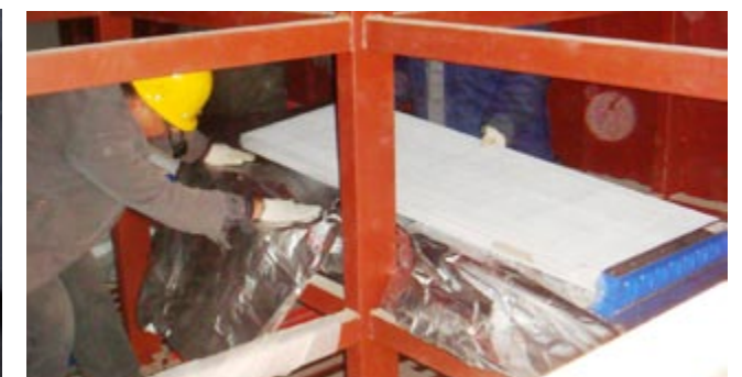
塑烧板安装过程 Installation of sinter-plate