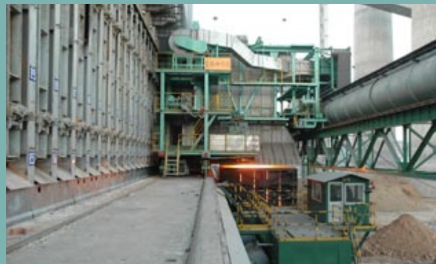
迁钢6m顶装焦炉拦焦机及集尘干管 Coke guide and main dedusting pipe for 6m top charging coke ovens of Qiangang