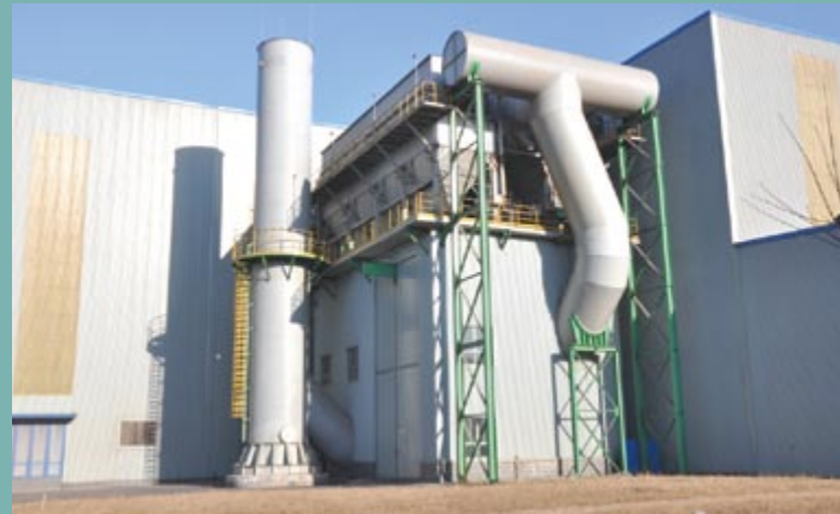
首钢京唐2250mm热轧精轧机除尘系统 Dedusting system of Shougang Jingtang 2250mm hot finishing mill