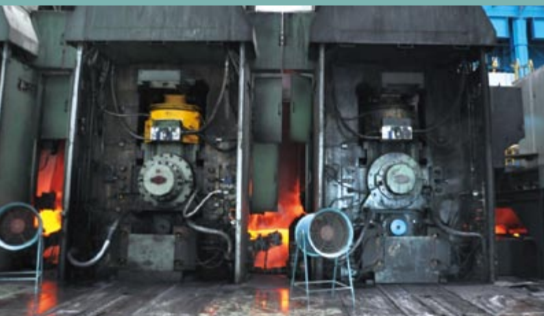
精轧机除尘系统不运行时烟尘情况 Fume dust condition in case of stop of finishing mill dedusting system

Operating status: The effectiveness of dehydrator is notable, dedusting system operates stably, trapping and discharging are better than relevant standards.