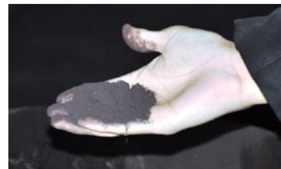
除尘器出灰 Dust discharged from deduster